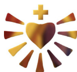
Sacred Heart Battersea